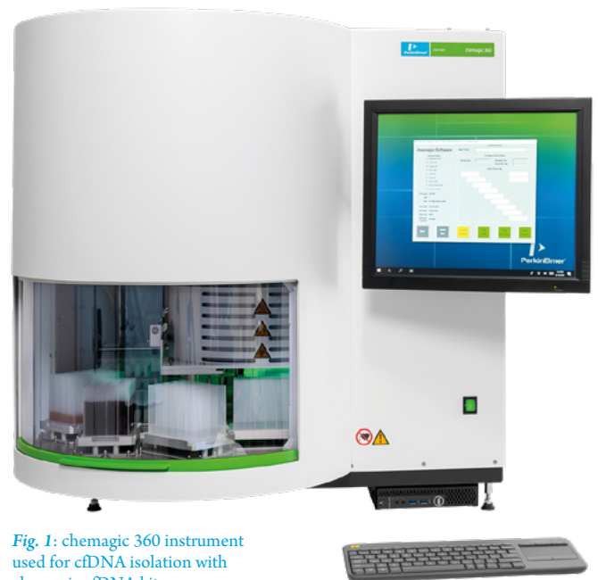
Fig. 1: chemagic 360 instrument used for cfDNA isolation with chemagic cfDNA kits.

For more details about the technology, visit https://chemagen.com/technology/